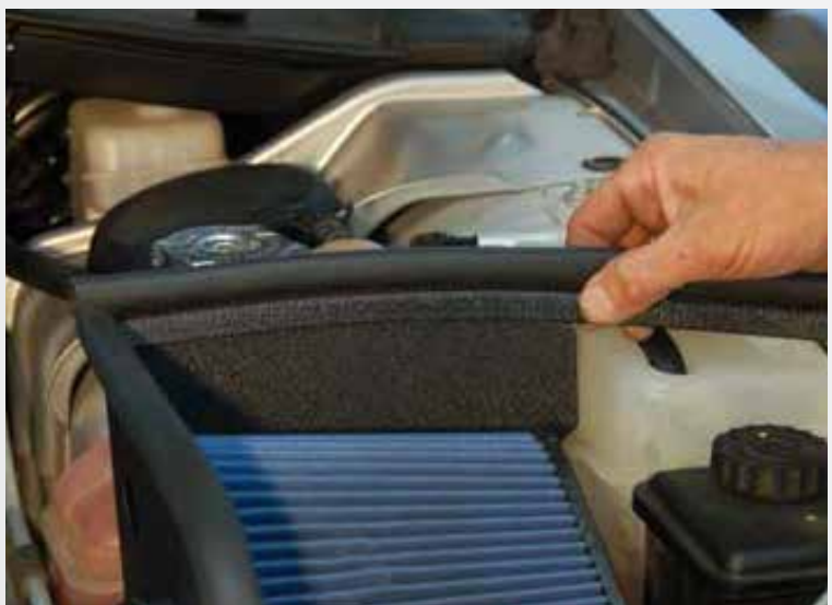
From the supplied hardware kit, find the aluminum pin and 1/4" Phillips screw and install on the BBK filter shield. Install the stock rubber grommet onto the pin. Install the supplied sponge rubber seal to the top of the filter shield.