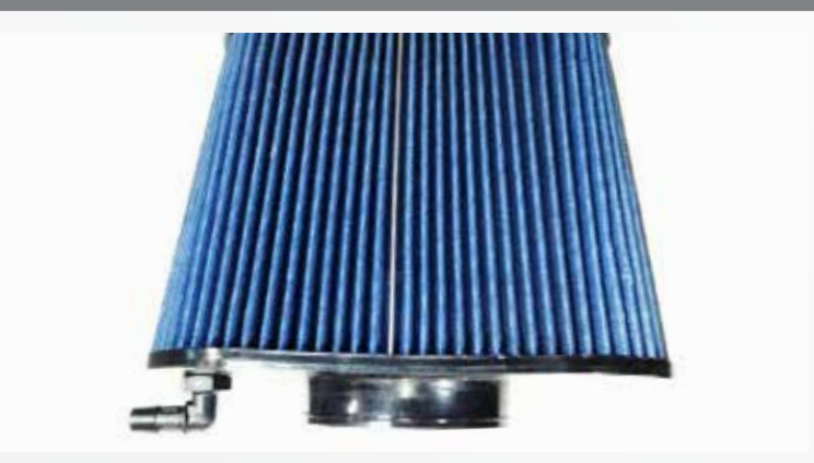
The 5.7L Engines require the use of the 90 degree fitting for the breather hose.