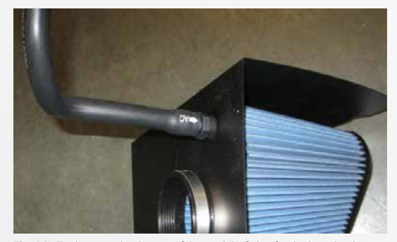
The 6.1L Engines require the use of the straight fitting for the breather hose.