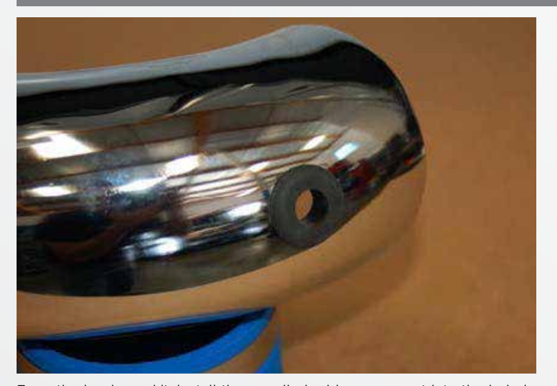
From the hardware kit, install the supplied rubber grommet into the hole in the BBK Inlet Tube. Install the Air Temperature Sensor into the grommet.