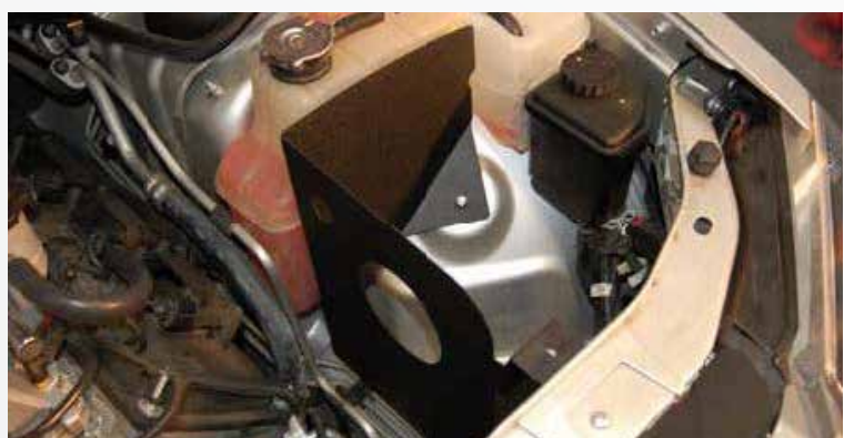
Place the filter shield into place in the engine compartment and line up the grommet with its hole. Mount the front tab of the filter shield using the stock bolt.