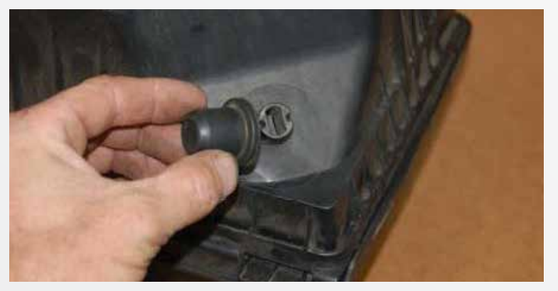
On the bottom rear of the stock air box, remove the rubber grommet for reuse with the BBK filter shield.