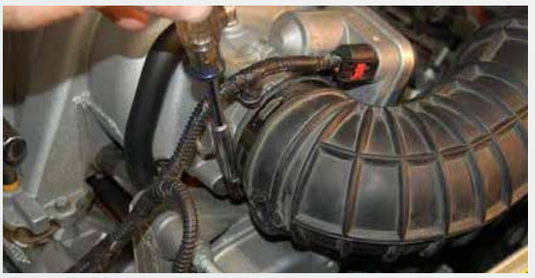
Unplug the air temperature sensor on the stock inlet tube. Remove the sensor for re-use in the BBK inlet tube. Loosen the clamp at the throttle body.