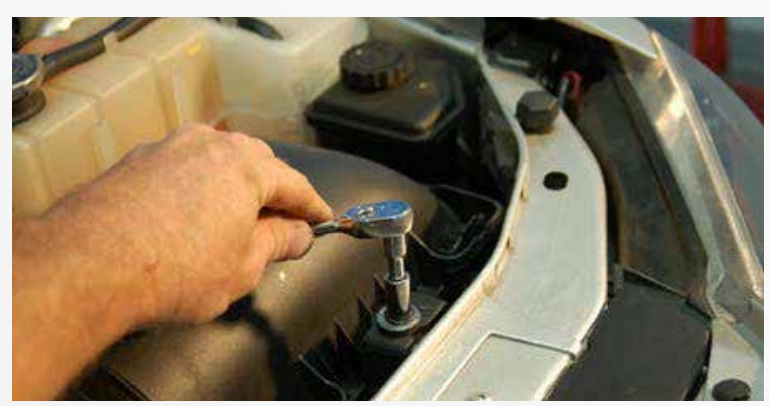
Remove the bolt that mounts the front of the air box to the vehicle. Lift out the air box and remove with the inlet hose.