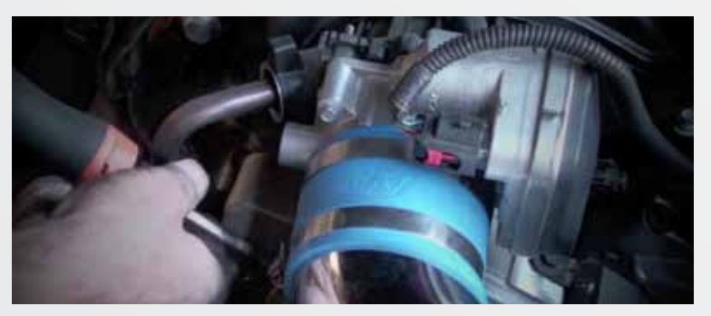
Loosen the clamps on the air intake tube and air box, and then remove the tube.