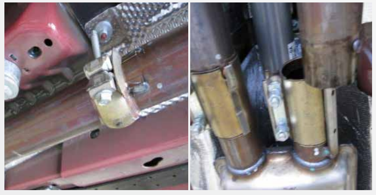
Loosen the ball flare clamp on the driver side pipe near the transmission cross member then loosen the exhaust coupler at the resonator and remove the driver side pipe from the vehicle.