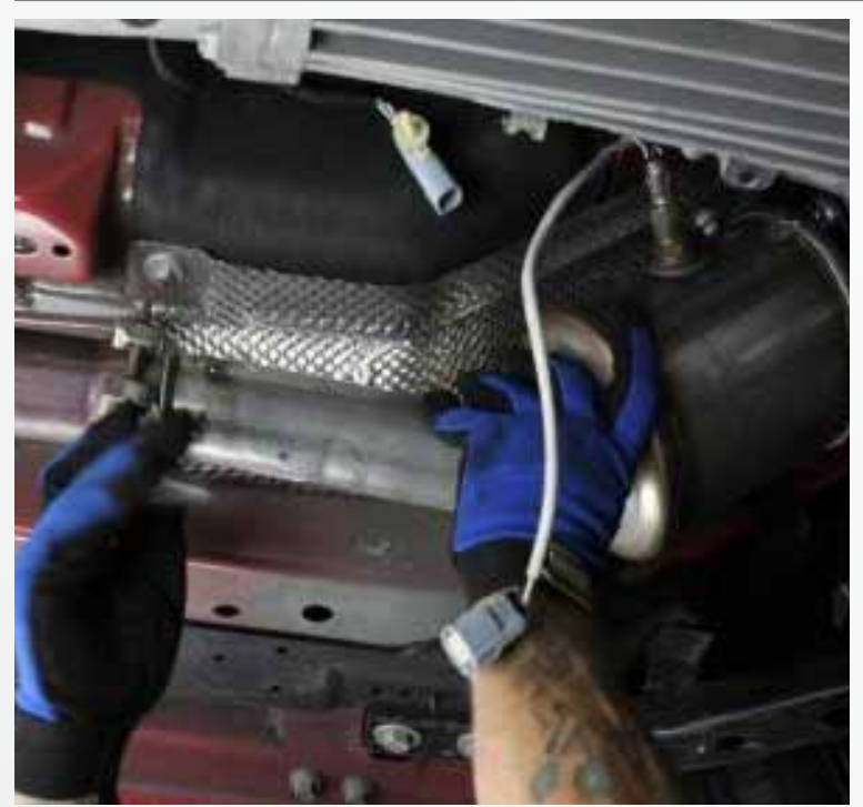
Install the stock catted down pipe back onto the exhaust line up the catted down pipe to the new flange and snug down the coupler that connects the mid pipe to the resonator, then just snug down the ball flare clamp enough so that you can still rotate the catted down pipe and align it with the hole in the flange.