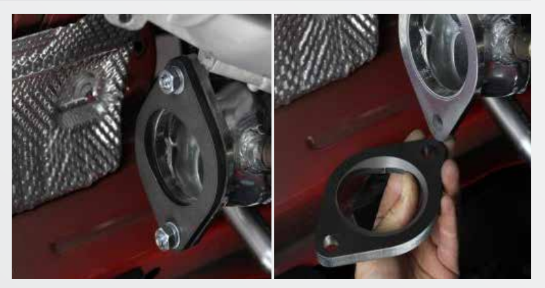
Using the supplied hardware install the supplied gasket and flange onto the BBK Tune length header. NOTE!!! Be sure to face the flange in the correct direction as pictured below.