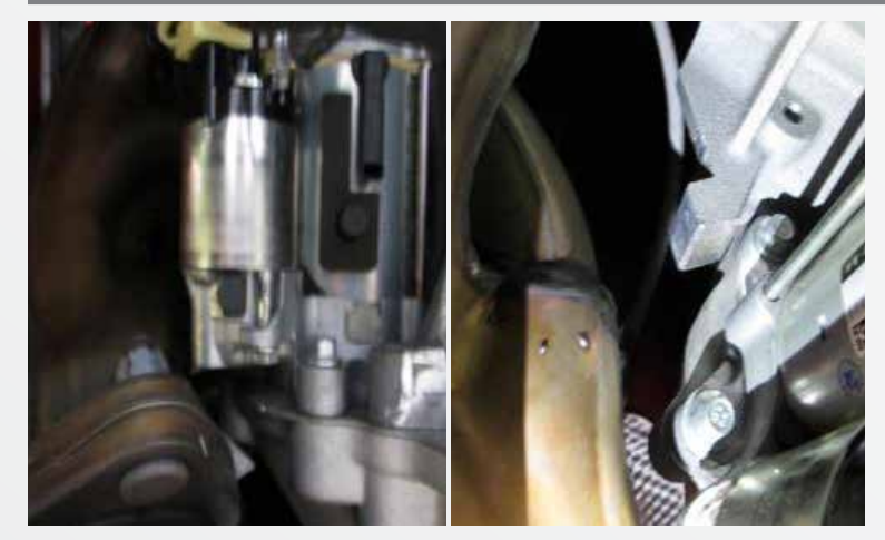
Remove the ( 3) 10mm bolts that hold the starter in place then remove the starter and hang it to the side.