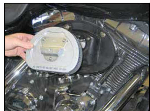
4. Remove the air filter from the vehicle and disconnect the crankcase breather tubes.