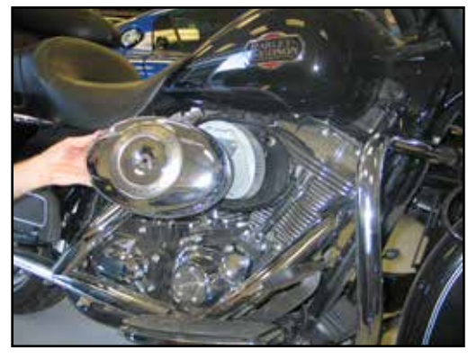
2. Remove the air filter cover bolt and air filter cover as shown.

1. Turn off the ignition and disconnect the negative battery cable.