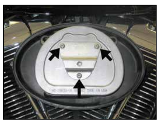
3. Loosen the three air filter retaining bolts shown.