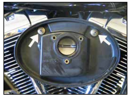
5. Remove the two breather / air filter base mounting bolts shown.

NOTE: K&N Engineering, Inc. recommends that customers do not discard the factory air intake components.