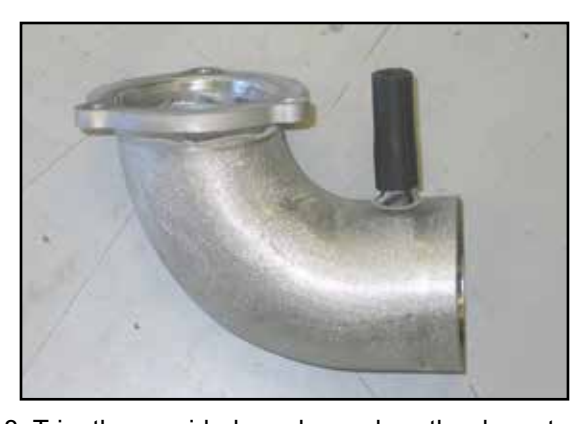
8. Trim the provided crankcase breather hose to a length of 1.5" and then install it onto the K&N® intake tube as shown.