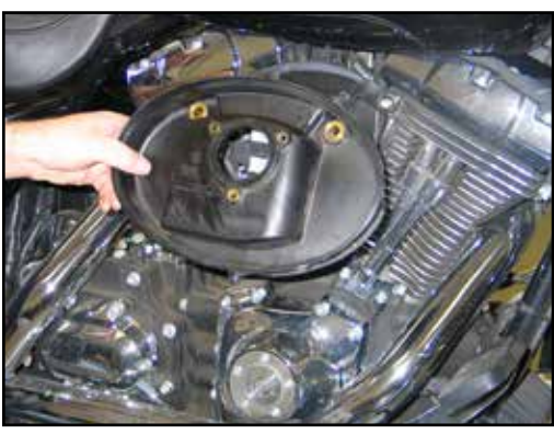
6. Remove the air filter base from the vehicle as shown.

NOTE: K&N Engineering, Inc. recommends that customers do not discard the factory air intake components.