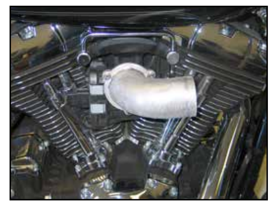
9. Install the K&N® intake tube onto the throttle body along with the provided gasket and secure with the provided mounting bolts.

NOTE: Apply a drop of the provided thread locker to the threads of the intake tube mounting bolts.