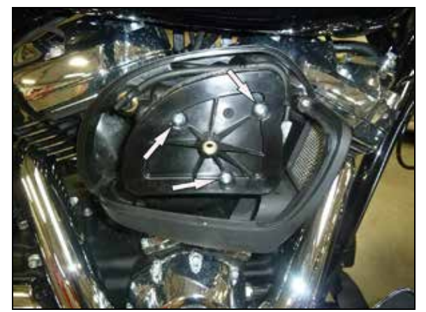
3. Loosen the three air filter retaining bolts as shown.