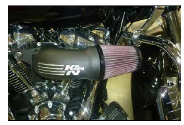
12. Install the K&N® air filter onto the intake tube and secure with the provided hose clamp.

NOTE: Apply one drop of the provided thread locker onto the studs.