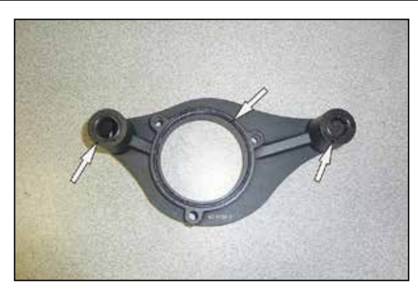
7. Install three of the o rings provided onto the back side of the K&N® back plate as shown. A small amount of grease maybe used to hold the o rings in place.