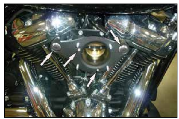
10. Using the two provided crankcase breather bolts; install the back plate onto the vehicle. Do not tighten bolts at this time. Then secure with the two other bolts provided. Tighten all bolts at this time.

NOTE: Apply one drop of the provided thread locker onto the bolts.