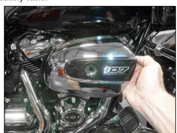
2. Remove air filter cover bolt and air filter cover as shown.

1. Turn off the ignition and disconnect the negative battery cable.