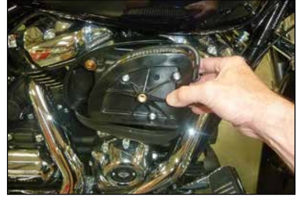
4. Remove the air filter from the vehicle and disconnect the crankcase breather tubes.