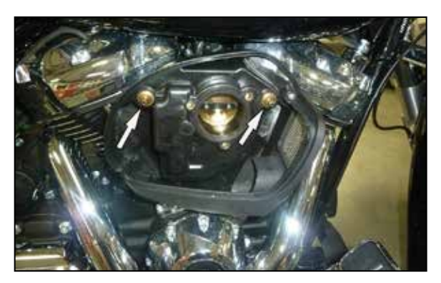
5. Remove the two breather/air filter base mounting bolts as shown.