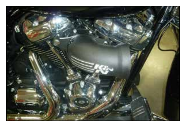
11. Install the K&N® intake tube with the gasket and provided hardware.

NOTE: On applications that have had the support bracket removed, install the two provided spacers between the back plate and cylinder head at the breather holes and then install the breather bolts as shown