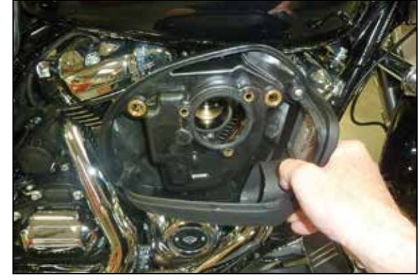
6. Remove the air filter base from the vehicle as shown.

NOTE: K&N Engineering, Inc. recommends that customers do not discard the factory air intake components.