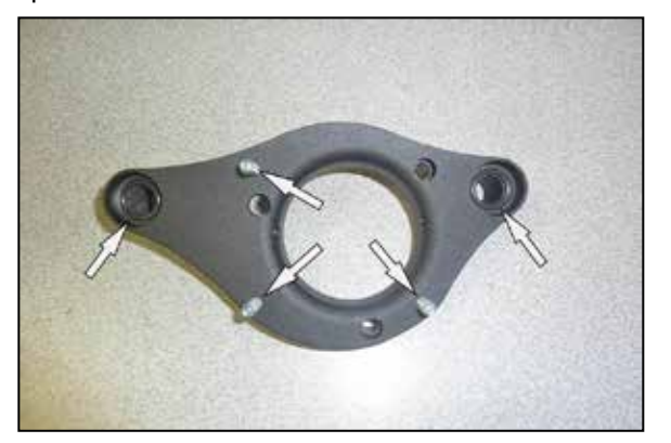
8. Install the remaining two o rings onto the front of the back plate as shown. Install the three provided studs with thread locker positioned into the back plate.