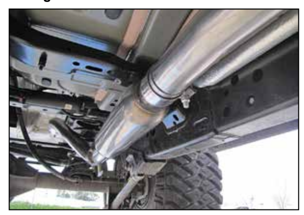
12. Install the K&N® muffler onto the K&N® mid pipe and into the factory hanger.

NOTE: Do not completely tighten the clamp at this time, all clamps should be left loosely installed until the complete system is installed and aligned.