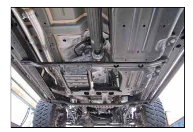
10. Reinstall the transfer case skid plate and secure with the factory bolts.