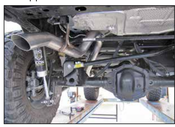
16. Check alignment and reposition as necessary. Once final position is satisfactory, tighten all band clamps from front to rear of vehicle.