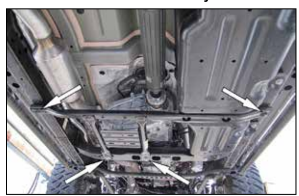
6. Remove the four bolts that secure the transfer case skid plate and the remove the skid plate from the vehicle.

NOTE: K&N Engineering, Inc., recommends that customers do not discard factory exhaust.