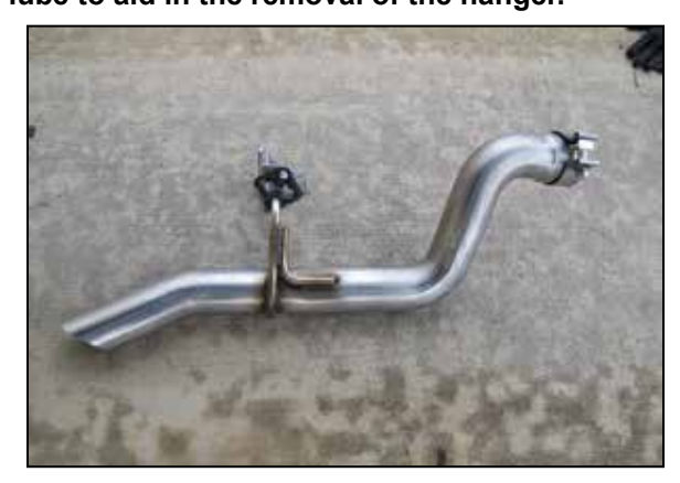
14. Install the driver side muffler hanger onto the K&N® tail pipe hanger.

NOTE: if necessary, apply a small amount of lube to aid in the removal of the hanger.