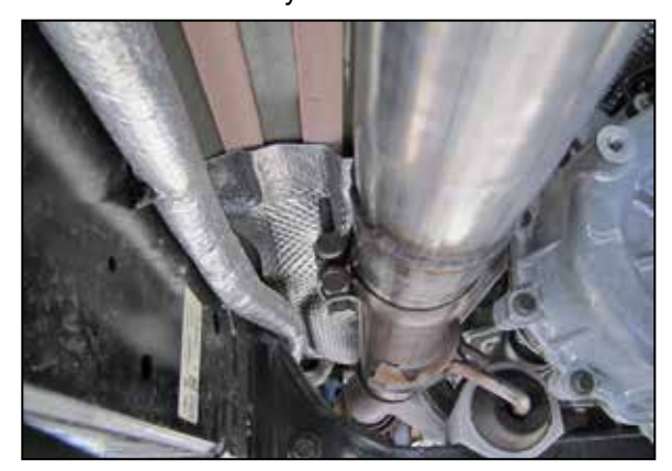
11. Install the K&N® mid pipe to the factory catalyst pipe and secure with the factory clamp.

NOTE: Do not completely tighten the clamp at this time, all clamps should be left loosely installed until the complete system is installed and aligned.