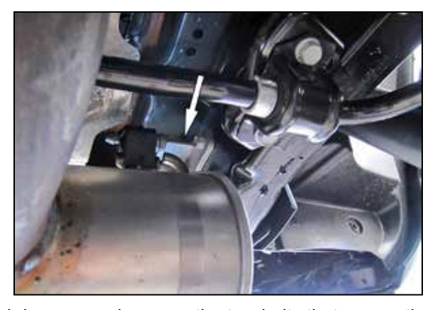
4. Loosen and remove the two bolts that secure the passenger side muffler hanger to the chassis. NOTE: one bolt is not in view in this picture. Support the muffler assembly while removing the bolts as it may now swing and fall.