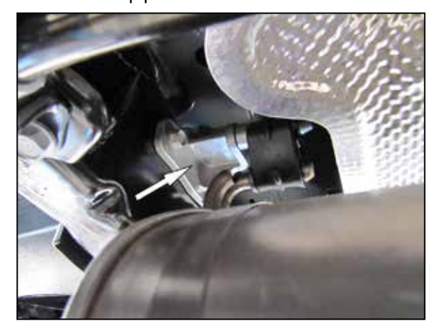
3. Loosen and remove the two bolts that secure the driver side muffler hanger to the chassis. NOTE: one bolt is not in view in this picture.