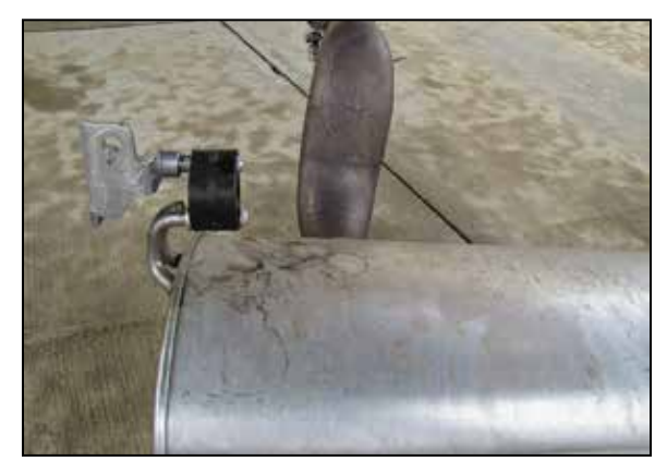
13. Remove the driver side muffler hanger from the stock muffler.

NOTE: Do not completely tighten the clamp at this time, all clamps should be left loosely installed until the complete system is installed and aligned.