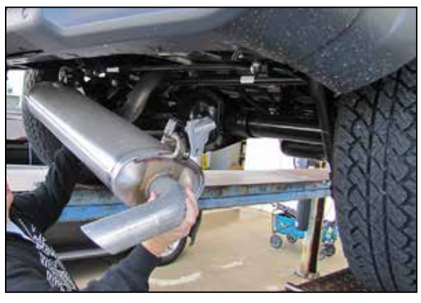
5. Using a twisting motion so the muffler pipe slides off the exhaust pipe, remove the muffler assembly from the vehicle.

NOTE: K&N Engineering, Inc., recommends that customers do not discard factory exhaust.