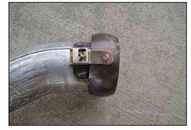
9. Release the locking tab and then remove the factory clamp from the exhaust pipe.