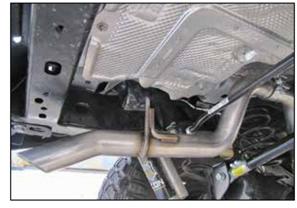
15. Install the K&N® tail pipe onto the K&N® exhaust pipe.