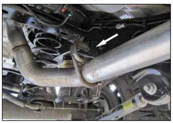
8. Disconnect the exhaust pipe hanger and then remove the exhaust pipe from the vehicle. NOTE: Applying some lube to the mount post may aid in removal of the hanger.