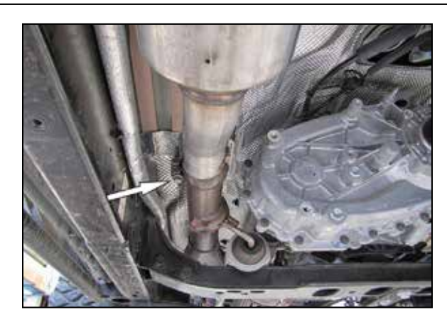
7. Loosen the clamp the secures the exhaust mid pipe to the exhaust catalyst pipe.