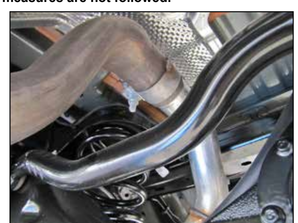
2. Loosen the clamp that secures the muffler pipe to the exhaust pipe.

Raise the vehicle to access the factory exhaust system with a lift or appropriate jack and properly positioned stands. It may be helpful to spray all existing hardware and hanger assemblies being removed with a penetrating oil or similar lubricant and allow to soak, especially if older and rusted. WARNING: If working without a lift always use the correct jack points and lifting procedures specified by the vehicle manufacturer. Serious injury or death could occur if proper safety measures are not followed.