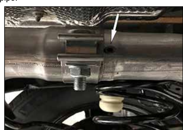
9. Make sure the K&N® tailpipe rests up against the clocking feature on the factory mid-pipe.