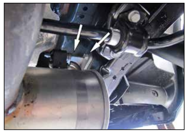
3. Loosen and remove the two bolts that secure the driver side muffler hanger to the chassis.

NOTE: one bolt is not in view in this picture.