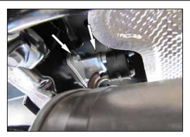
4. Loosen and remove the two bolts that secure the passenger side muffler hanger to the chassis. NOTE: one bolt is not in view in this picture. Support the muffler assembly while removing the bolts as it may now swing and fall.

NOTE: one bolt is not in view in this picture.