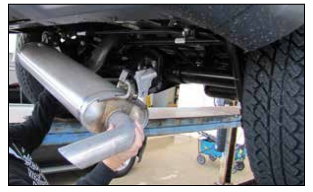
5. Using a twisting motion so the muffler pipe slides off the exhaust pipe, remove the muffler assembly from the vehicle.

NOTE: K&N Engineering, Inc., recommends that customers do not discard factory exhaust.