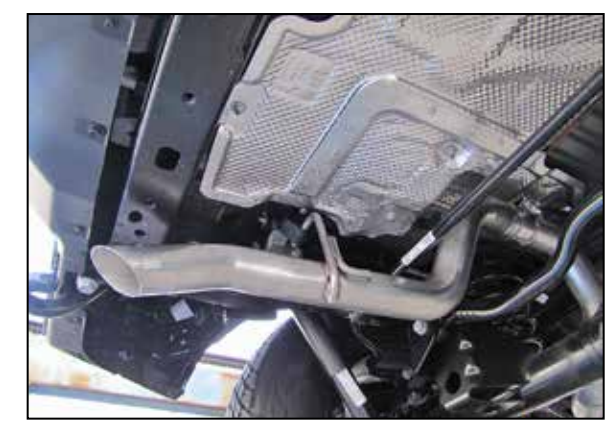
8. Install the K&N® tail pipe onto the factory exhaust pipe.