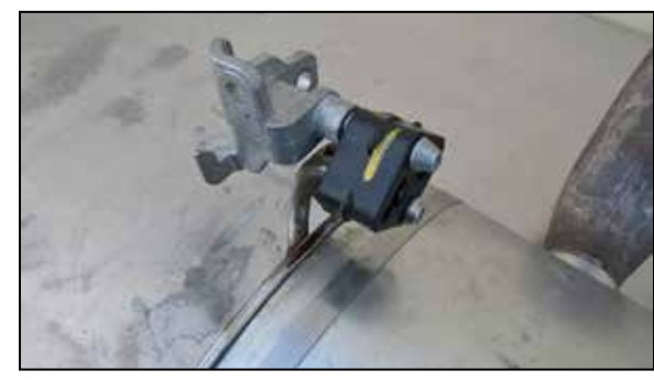
6. Remove the driver side muffler hanger from the stock muffler.

NOTE: K&N Engineering, Inc., recommends that customers do not discard factory exhaust.