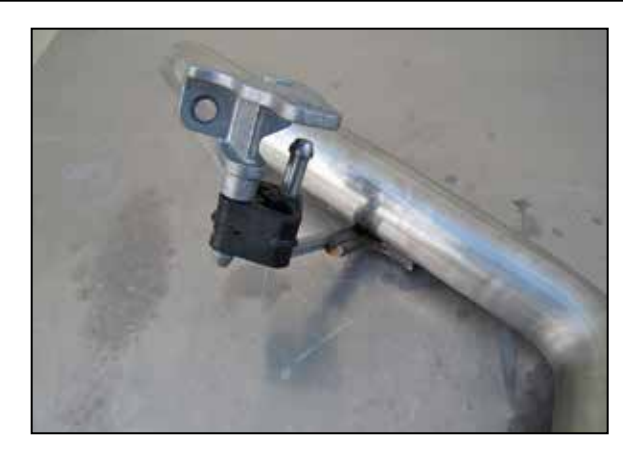
7. Install the driver side muffler hanger onto the K&N® tail pipe hanger.

NOTE: if necessary, apply a small amount of lube to aid in the removal of the hanger.