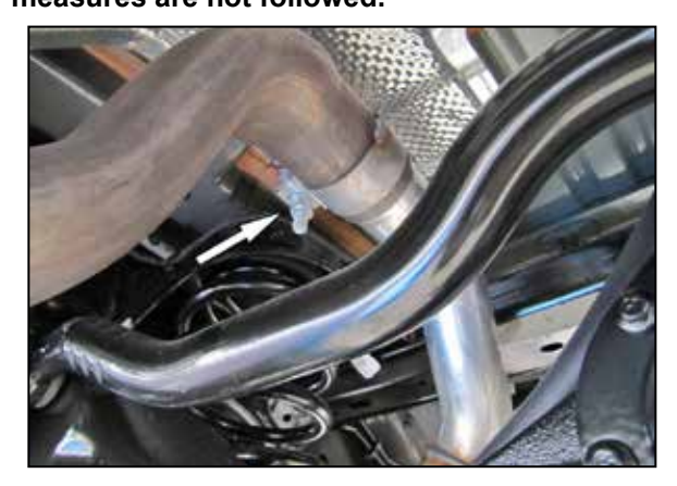
2. Loosen the clamp that secures the muffler pipe to the exhaust pipe.

Raise the vehicle to access the factory exhaust system with a lift or appropriate jack and properly positioned stands. It may be helpful to spray all existing hardware and hanger assemblies being removed with a penetrating oil or similar lubricant and allow to soak, especially if older and rusted. WARNING: If working without a lift always use the correct jack points and lifting procedures specified by the vehicle manufacturer. Serious injury or death could occur if proper safety measures are not followed.