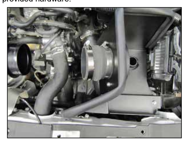
11. Install the provided coupling hose (087121) onto the filter adapter and secure with the provided hose clamp.