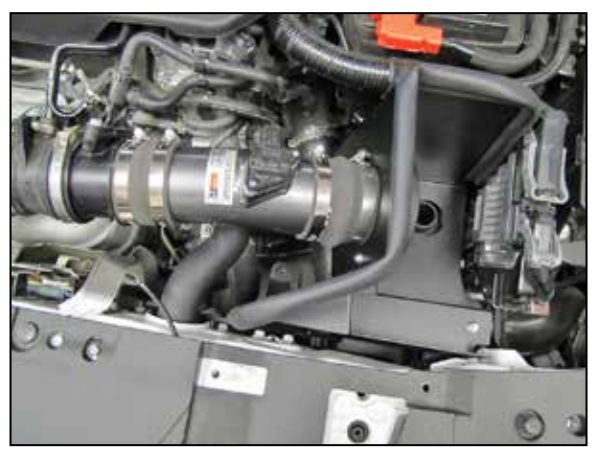
14. Install the K&N® intake tube into the coupler at the filter adapter and align with the turbo inlet pipe, slide the coupler back onto the turbo inlet pipe and adjust the tube for best fit. Secure the intake tube with the provided hose clamps.