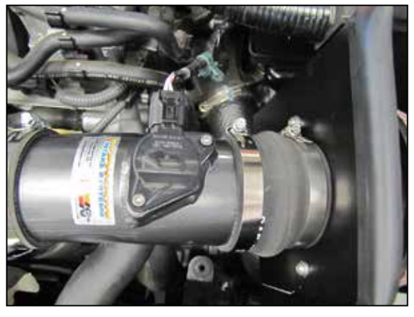
16. Reconnect the mass air sensor electrical connection.