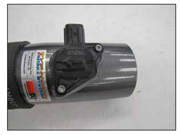
13. Remove the mass air sensor from the factory air filter housing and then install it into the K&N® intake tube and secure with the provided hardware.