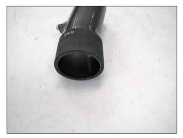
12. Install the provided coupling hose (08711) onto the intake tube so that id slides all the way on. Do not secure the hose now.