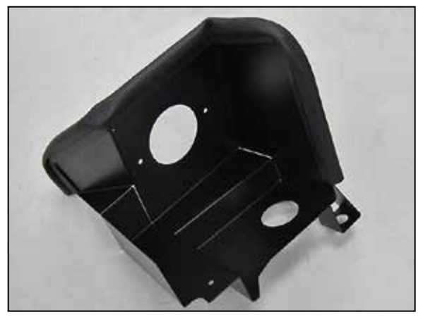
6. Install the provided edge trim onto the heat shield as shown.

NOTE: K&N Engineering, Inc., recommends that customers do not discard factory air intake.