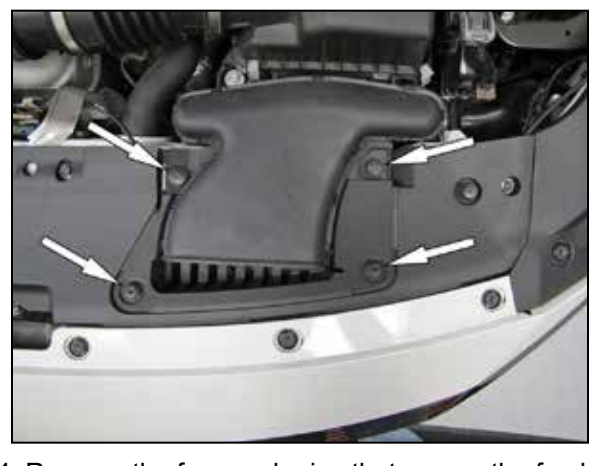
4. Remove the four push pins that secure the fresh air intake duct and then lift the fresh air intake duct out to remove it from the vehicle.