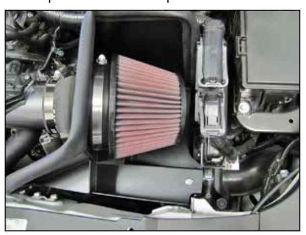
Install the K&N® air filter onto the filter adapter and secure with the provided hose clamp.