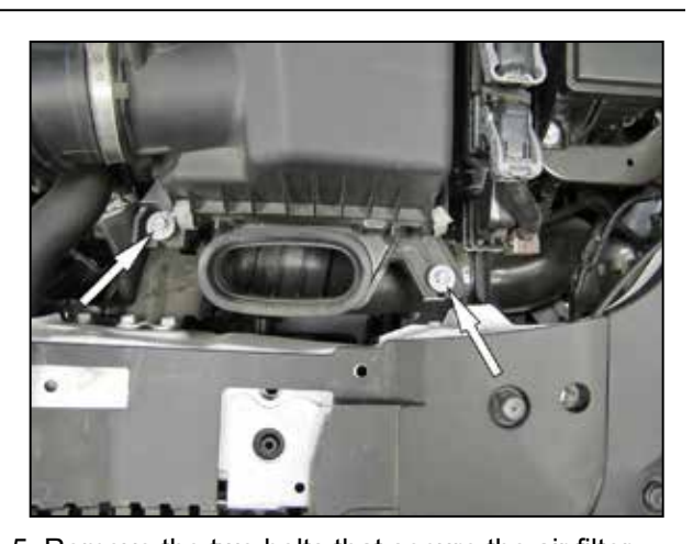
5. Remove the two bolts that secure the air filter housing to the inner fender and then remove the bolts from the vehicle.

NOTE: K&N Engineering, Inc., recommends that customers do not discard factory air intake.