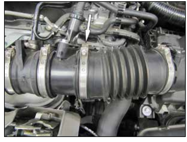
3. Loosen the hose clamp that secures the intake hose to the turbo inlet tube.