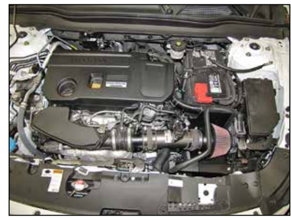
17. Reconnect the vehicle's negative battery cable. Double check to make sure everything is tight and properly positioned before starting the vehicle.

18. It will be necessary for all K&N® high flow intake systems to be checked periodically for realignment, clearance and tightening of all connections. Failure to follow the above instructions or proper maintenance may void warranty.