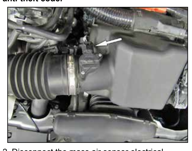
2. Disconnect the mass air sensor electrical connection.

NOTE: Disconnecting the negative battery cable erases pre-programmed electronic memories. Write down all memory settings before disconnecting the negative battery cable. Some radios will require an anti-theft code to be entered after the battery is reconnected. The anti-theft code is typically supplied with your owner's manual. In the event your vehicles anti-theft code cannot be recovered, contact an authorized dealership to obtain your vehicles anti-theft code.