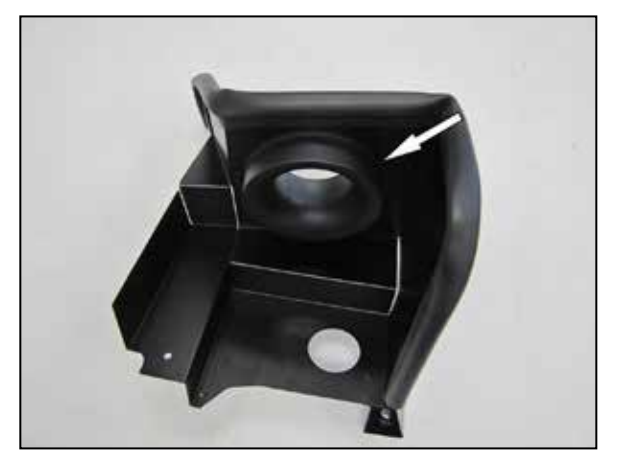
8. Install the provided filter adapter into the heat shield and secure with the provided hardware.