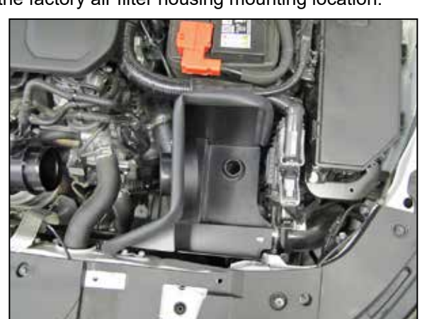
10. Install the heat shield and secure with the provided hardware.