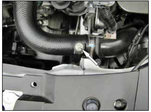
9. Install the provided rubber mounted stud onto the factory air filter housing mounting location.