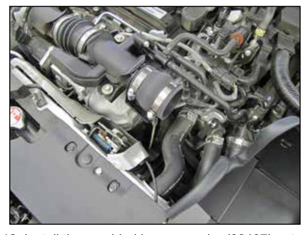
12. Install the provided hump coupler (08487) onto the turbo inlet and secure with the provided hose