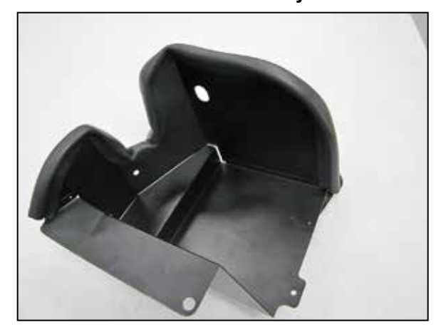
6. Install the provided edge trim onto the heat shield as shown, some trimming of the edge trim will be necessary.

NOTE: K&N Engineering, Inc., recommends that customers do not discard factory air intake.