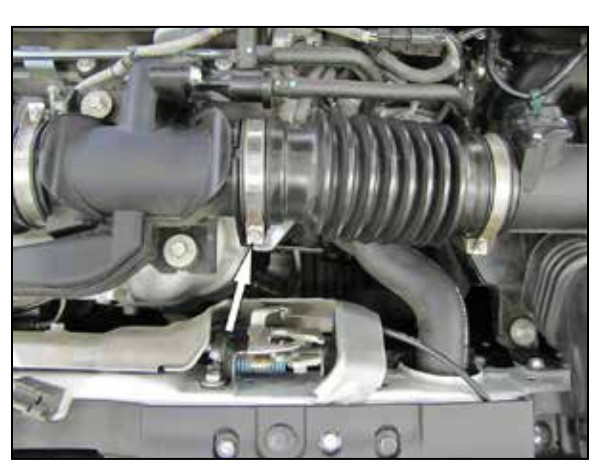
3. Loosen the hose clamp that secures the intake tube to the turbo inlet pipe.