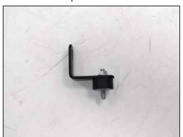
10. Install the provided rubber mounted stud onto the tube mounting bracket as shown using the provided hardware.