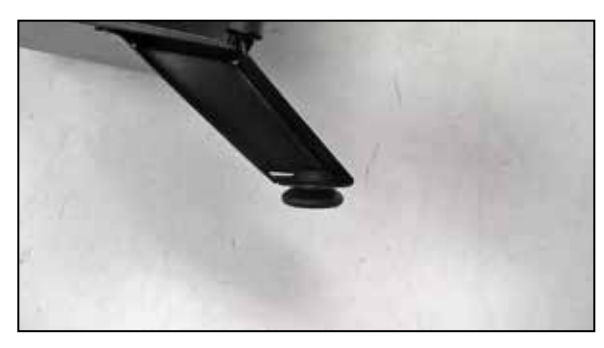
7. Remove the mounting grommet from the factory air filter housing and install it into the K&N® heat