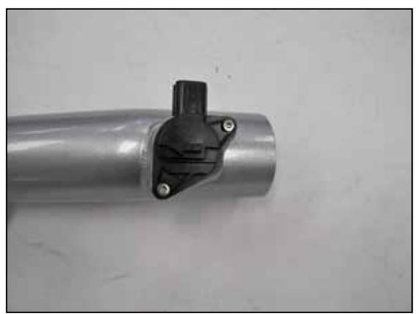
9. Remove the mass air sensor from the factory intake tube and install it into the K&N® intake tube and secure with the provided hardware.