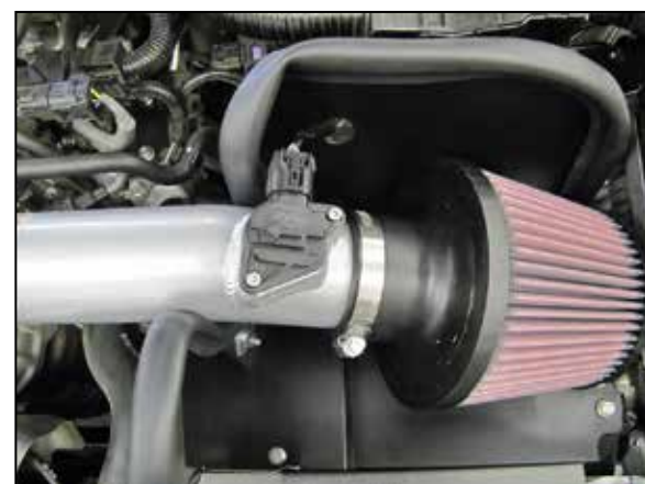
15. Route the mass air sensor wiring harness through the hole provided in the heat shield and then reconnect the mass air sensor electrical connection.

NOTE: Drycharger® air filter wrap; part # RX-4990DK is available to purchase separately. To learn more about Drycharger® filter wraps or look up color availability please visit http://www.knfilters.com®.