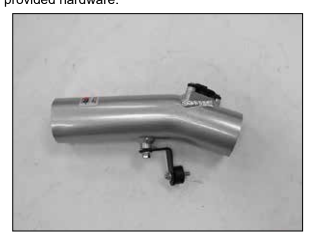
11. Install the mounting bracket assembly onto the K&N® intake tube as shown using the provided hardware.