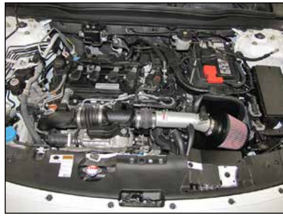
16. Reconnect the vehicle's negative battery cable. Double check to make sure everything is tight and properly positioned before starting the vehicle.

17. It will be necessary for all K&N® high flow intake systems to be checked periodically for realignment, clearance and tightening of all connections. Failure to follow the above instructions or proper maintenance may void warranty.