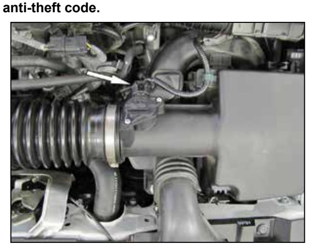
2. Disconnect the mass air sensor electrical connection.

NOTE: Disconnecting the negative battery cable erases pre-programmed electronic memories. Write down all memory settings before disconnecting the negative battery cable. Some radios will require an anti-theft code to be entered after the battery is reconnected. The anti-theft code is typically supplied with your owner's manual. In the event your vehicles anti-theft code cannot be recovered, contact an authorized dealership to obtain your vehicles