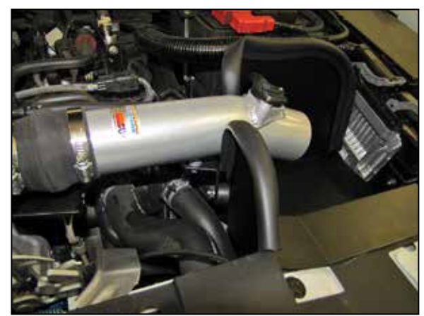
13. Install the K&N® intake tube into the coupler at the turbo inlet and then align the mounting stud with the hole in heat shield. Adjust the intake tube for best fit and then secure with the provided hardware and hose clamp.