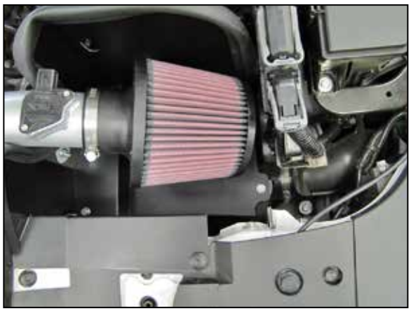
14. Install the K&N® air filter and secure with the provided hose clamp.

NOTE: Drycharger® air filter wrap; part # RX-4990DK is available to purchase separately. To learn more about Drycharger® filter wraps or look up color availability please visit http://www.knfilters.com®.