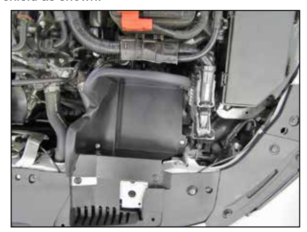
8. Install the heat shield assembly into the vehicle and secure with the provided hardware and one of the push pins that originally secured the fresh air intake. Install the three remaining push pins to fill the original mounting holes.