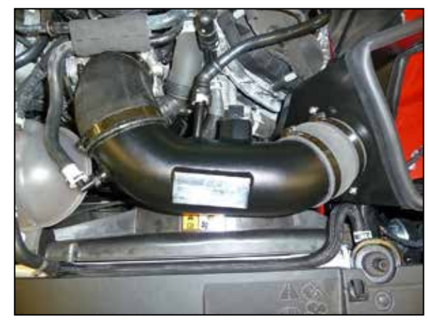
16. Install the intake tube into the coupler at the throttle body and onto the coupler at the filter adapter, adjust the tube for best fit and then secure the tube to the coupling hoses with the provided hose clamp. Connect the EVAP and crank case vent lines to the fittings installed into the K&N® intake tube.