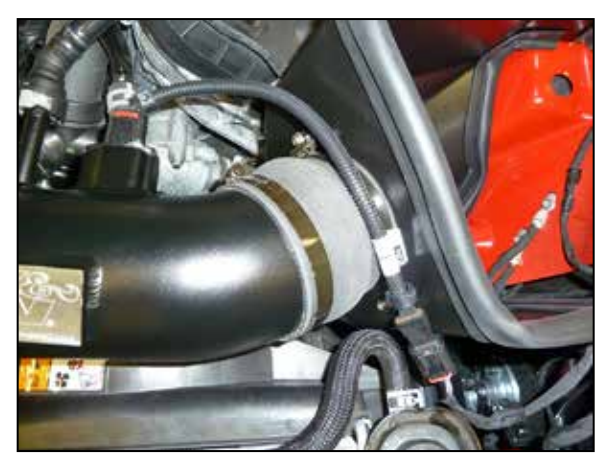
17. Reconnect the mass air sensor electrical connection.