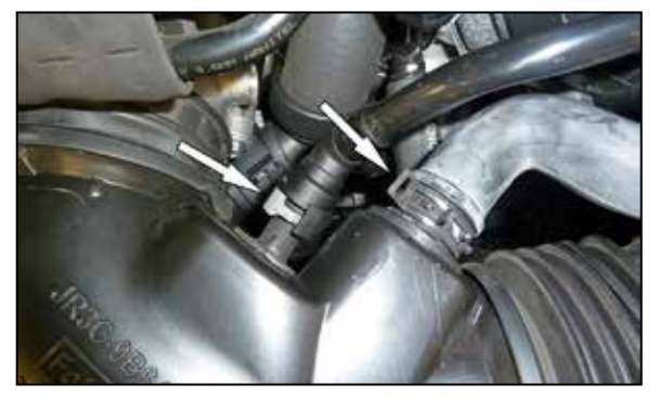
5. Disconnect the vent lines and sound tube attached to the intake tube. Loosen the hose clamps that secure the intake tube to the air filter housing and throttle body and then remove the intake tube from the vehicle.