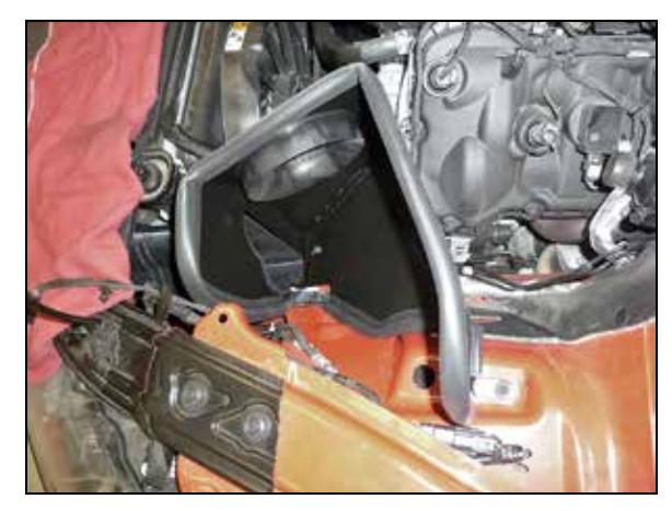
12. Install the heat shield assembly onto the inner fender and secure with the provided hardware. NOTE: The K&N® fresh air duct should be around the factory inlet duct.