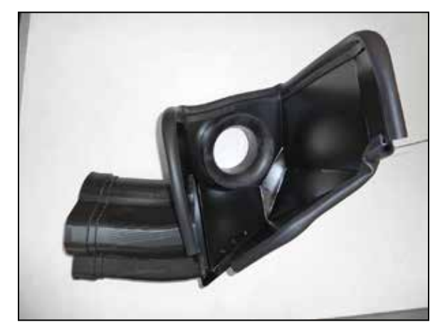
11. Install the provided fresh air duct into the heat shield as shown.