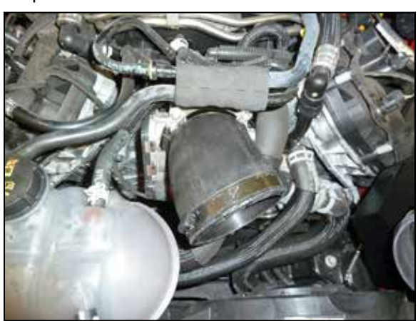
14. Install the provided angled coupler hose (5-1100) onto the throttle body and secure with the provided hose clamp