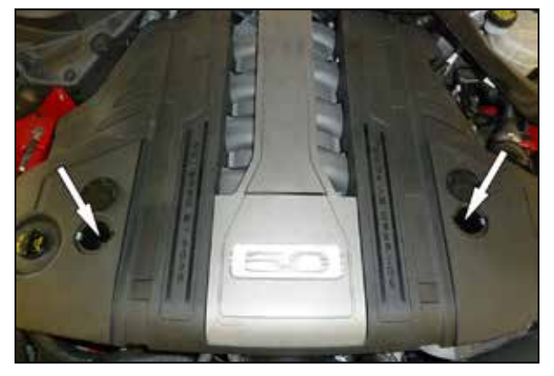
3. Remove the fastener covers on the engine cover, remove the two nuts that secure the cover and then remove the cover from the engine.