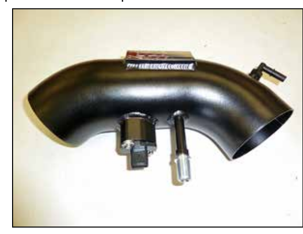
15. Install the Provided 90° fitting into the K&N® intake tube. Remove the mass air sensor from the factory housing and install it into the K&N® intake tube using the provided hardware.