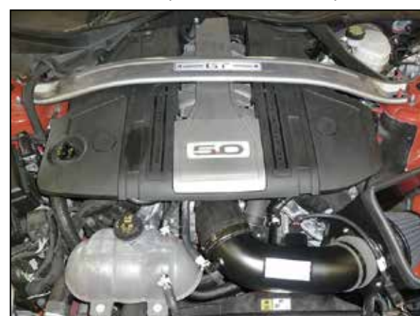
20. Reinstall the engine cover and secure with the factory hardware, reinstall the nut covers. Reinstall the strut tower brace and secure with the factory nuts.