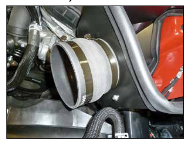
13. Install the provided hump coupler (08418) onto the filter adapter and secure with the provided hose clamp.