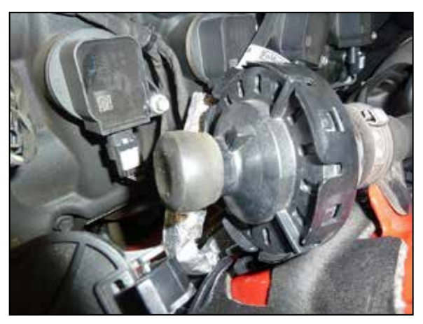
18. Install the provided cap onto the sound drum as shown.