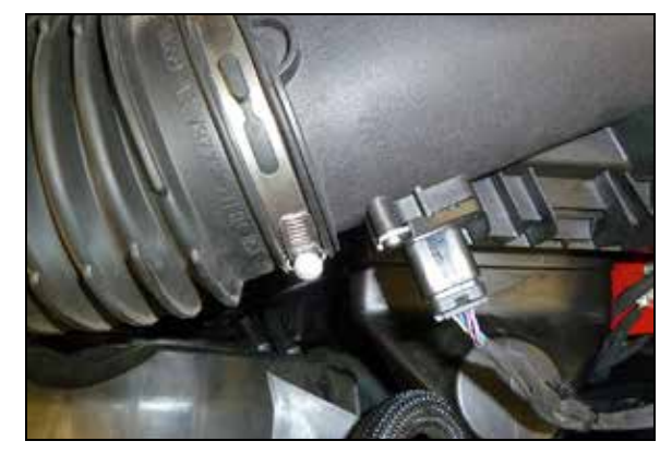
4. Disconnect the mass air sensor electrical connection.