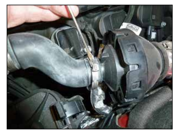
6. Release the one-time use clamp that secures the sound tube to the drum and then disconnect and remove the sound tube from the vehicle.