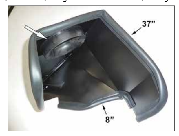
9. Install the provided edge trim onto the K&N® heat shield as shown. Install the air filter adapter into the heat shield and secure with the provided hardware.