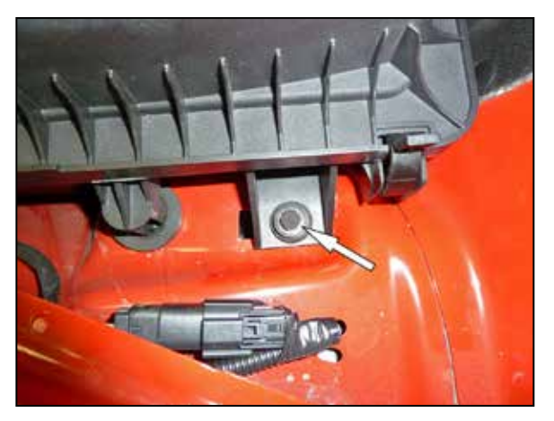
7. Remove the bolt that secures the air filter housing to the inner fender and then remove the lower air filter housing from the vehicle.