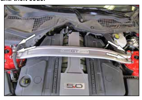
2. Remove the four nuts that secure the strut tower brace and then remove the strut tower brace from the vehicle.

NOTE: Disconnecting the negative battery cable erases pre-programmed electronic memories. Write down all memory settings before disconnecting the negative battery cable. Some radios will require an anti-theft code to be entered after the battery is reconnected. The anti-theft code is typically supplied with your owner's manual. In the event your vehicles anti-theft code cannot be recovered, contact an authorized dealership to obtain your vehicles anti-theft code.