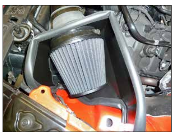
19. Install the K&N® air filter onto the filter adapter and secure with the provided hose clamp.